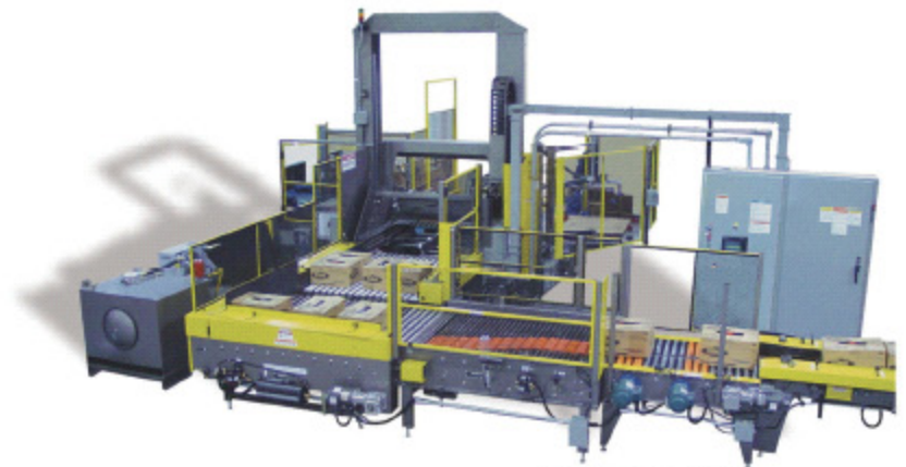
"Machine shown with optional equipment"

The Model FL510 floor level palletizer operates similar to the FL500, but is able to obtain faster speeds due to the addition of a special high speed side infeed section and larger pump capacity. The FL510 is ideal for palletizing food, beverages, consumer products and more by delivering tight, square and stable loads with no costly stops or delays. The FL510 palletizes 50 cases per minute or more, depending on case size and pallet pattern. Like all heavy-duty Columbia Machine palletizers it has a reliable welded frame that is "built to last" and is EASY TO OPERATE.